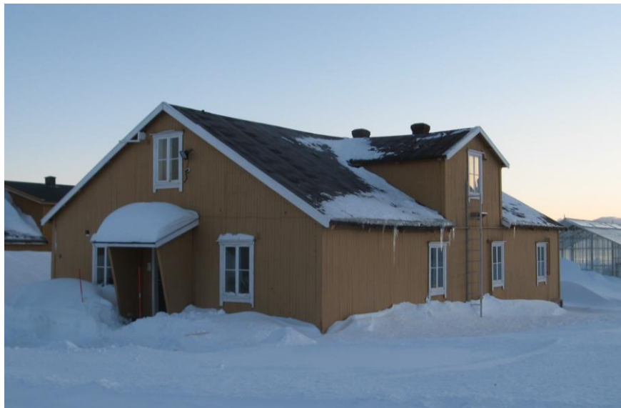
Himadri, Ny-Ålesund, Svalbard

Gruvebadat Atmospheric Laboratory is an atmosphere laboratory and observatory located midway between Ny-Ålesund, the Zeppelin observatory and the Climate Change Tower. India has a dedicated portion of the lab to install its instruments. At present, the lab has a microwave radiometer profiler, micro rain radar, ceilometer, nephelometer, aethalometer, aerodynamic particle sizer, net radiometer, and sun photometer.