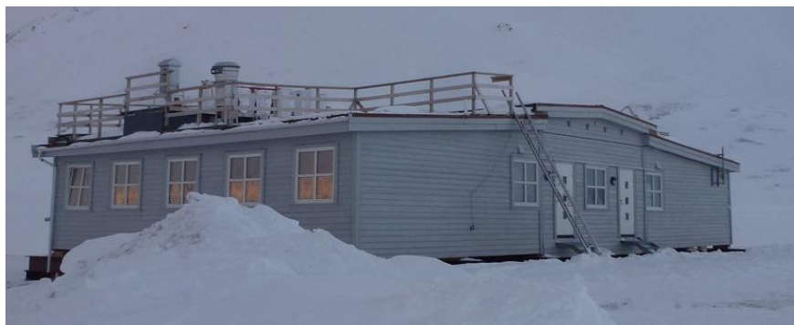
Gruvabadet Atmospheric Laboratory, Ny-Ålesund, Svalbard