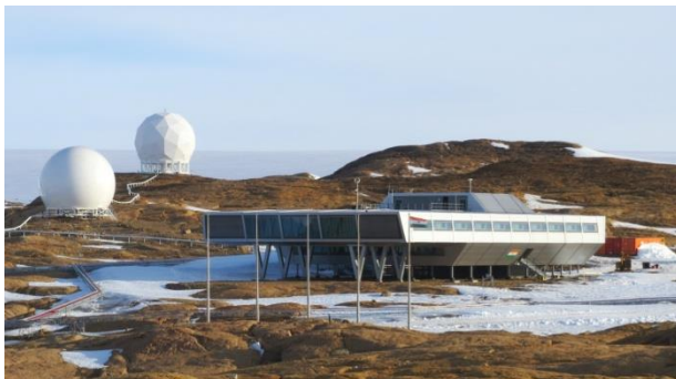
Bharati during austral summers

The main building offers regulated power supply, automated heat and air conditioning with hot and cold running water, flush toilets, sauna, cold storage, PA system, aesthetically designed living, dining, lounge and laboratory space, etc.