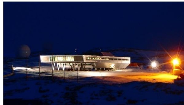
Bharati during austral winters